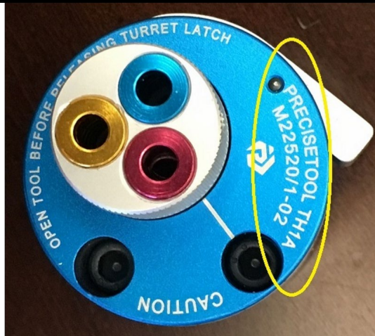
Precise Tool Counterfeit