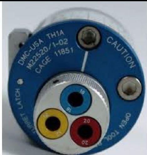
Daniels Manufacturing Corporation M22520/1-02 (TH1A)