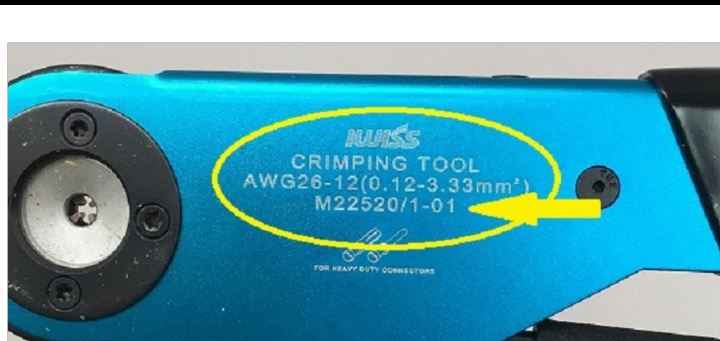
IWISS Electric Co Counterfeit