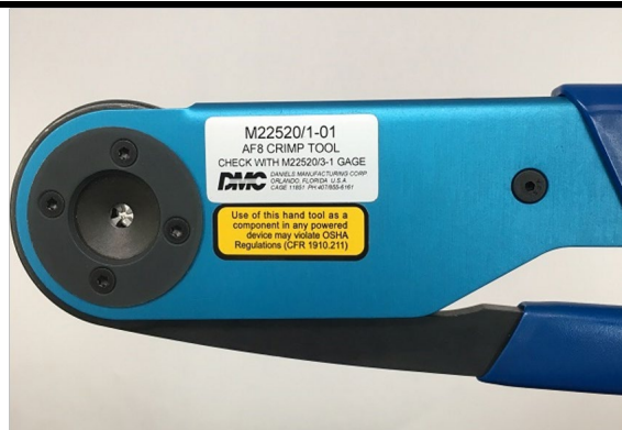
Daniels Manufacturing Corporation M22520/1-01 (AF8)