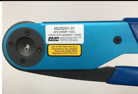
Daniels Manu facturing Corporation M22520/1-01 (AF8)